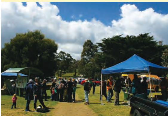
Melbourne Water Frog Trailer