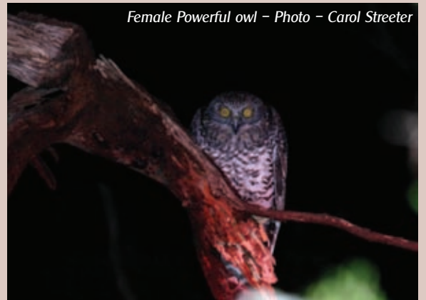
Female Powerful owl

Following the success of these educational walks, we will plan more in the future.