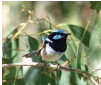
Superb Blue Wren