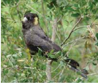
Yellow-tailed Black Cockatoo

A great benefit from the activities of the Friends group has been a growing awareness of the bird life that frequents Glen Fern. Among those attracted to watch and photograph birds has been Eduardo Garcia, whose enthusiasm, persistence and skill has seen him capture wonderful images of even the smaller bush birds whose frantic activity defeats the rest of us aspiring photographers! The small birds are important to control populations of many small insects, while the larger Black Cockatoos perform rough bush surgery on wattle trees to remove large borer grubs. All are important to maintain the health of the vegetation.