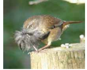
White Browed Scrub Wren with nesting material

Here are some examples of Eduardo's images shown with his kind permission. Article : Thank you to Ian Rainbow