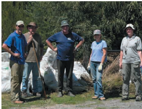
Successful weeders with trophies at New Road!

The new year has already seen two working bees in February; First to survey Riparian zone plants along Creek Track and weed the corner at New Road, filling 17 bags of weeds; and a second one to weed along Creek Track to bring this area of great natural regeneration much closer to being weed free.