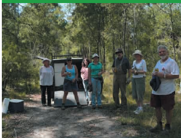
A well-earned break in the Riparian Zone!