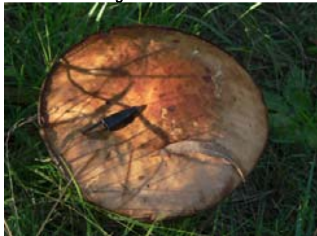
Fungi recently seen in the Reserve. A pen top shows the relative size.

Next Working Bee is Sunday 30 July (National Tree Day) where we will be planting 500 trees throughout the Reserve.