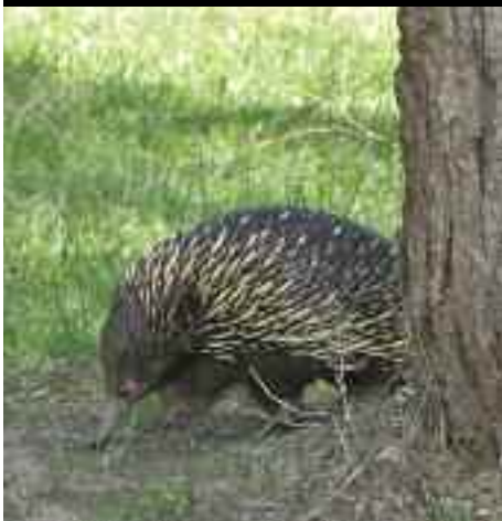
Echidna visiting Upwey South garden adjacent to Glen Fern Bushlands Reserve